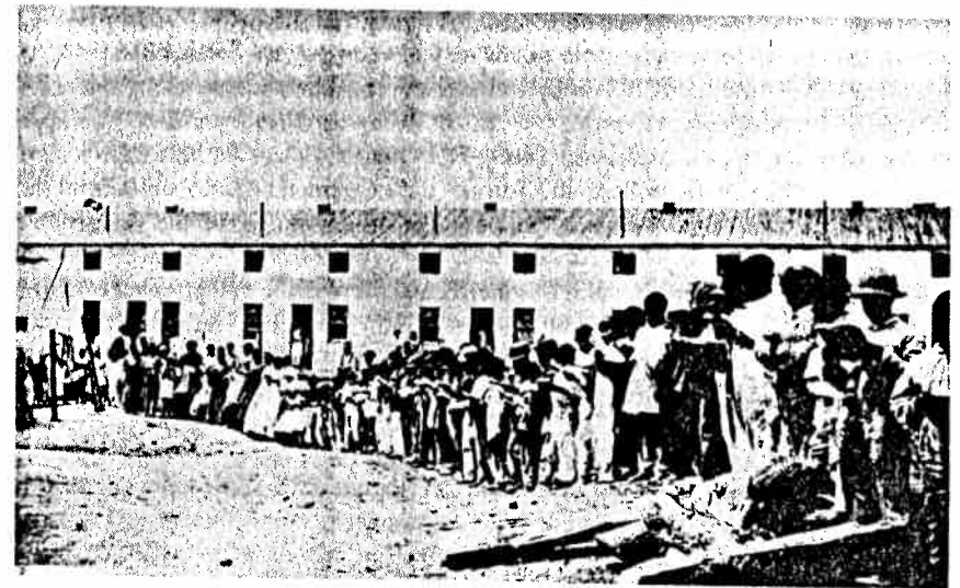
Contraband School At Freedman's Village, Arlington, Virginia